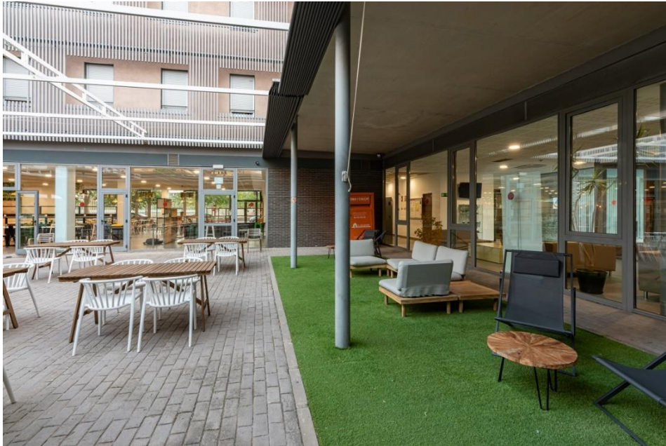
Resa Damià Bonet University Residence Campus dels Tarongers, Carrer del Serpis, 27, 46022 Valencia

The residence is modern, spacious and with premium facilities and services. It is located in a perfect area, exactly on Calle Serpis 27, right next to the Centre d'Idiomes UV on the Campus dels Tarongers de la UV. The comfort of the students is one of its main principles and the location of the building facilitates quick access to the classes of the language centre and the university area.