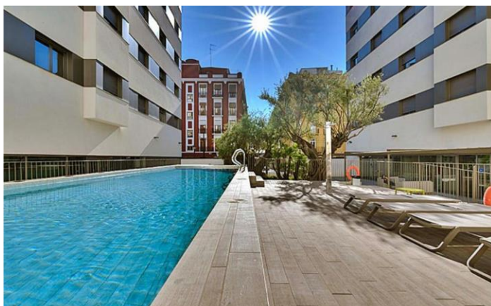
with community pool